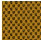
Network fabric 9 Colors