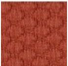
Tissu Visual 13 Couleurs