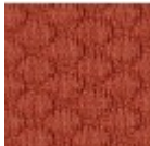
Tissu Visual 13 Couleurs